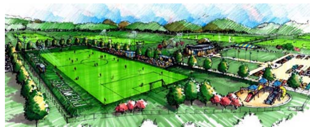
Integrate facilities with natural surroundings.

Our Master Planning process will develop and focus your vision, addressing your present needs while looking to the demands and realities of the future. Jeffrey L. Bruce & Company can successfully guide you through this process and will help you to realize success.