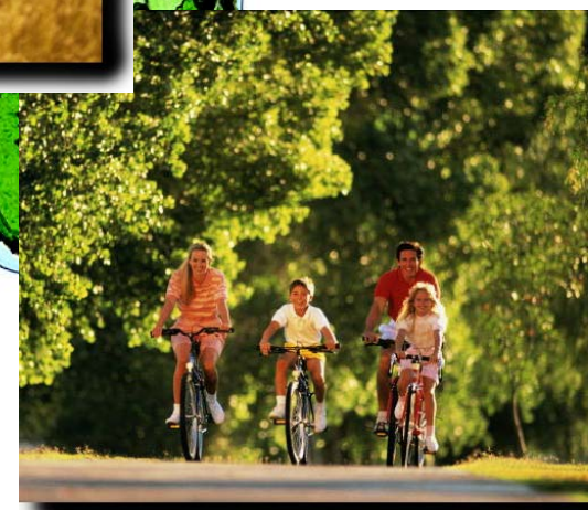
Craig Crossing Bike Trail, Lenexa, Kansas