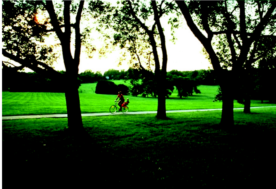
McLane Arboretum in Loose Park, Kansas City, Missouri.

Our experience in Park & Recreation planning and design coupled with our expertise in athletic field and sports turf design, has led us to be recognized as one of the nation's leading firms in the integration of competitive sports venues into the realm of Parks and Recreation facilities. With unique and innovative expertise, Jeffrey L. Bruce & Company brings a creative, sustainable and scientific perspective to each design project.